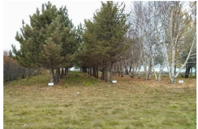
Fig. 1. Shelterbelts play a role in carbon storage and greenhouse gas mitigation

For more than a century, over 600 million shelterbelt trees have been distributed to land owners in the Canadian Prairies mainly to protect farms from soil erosion and extreme wind events. In Saskatchewan, there exists over 60,000 km of planted shelterbelts. Recent studies suggest that shelterbelts play a significant role in storing atmospheric carbon in the soil and in mitigating the emissions of greenhouse gases from agricultural activities (Fig. 1). With the on-going muse of developing a carbon pricing policy in Canada, there is a growing awareness that